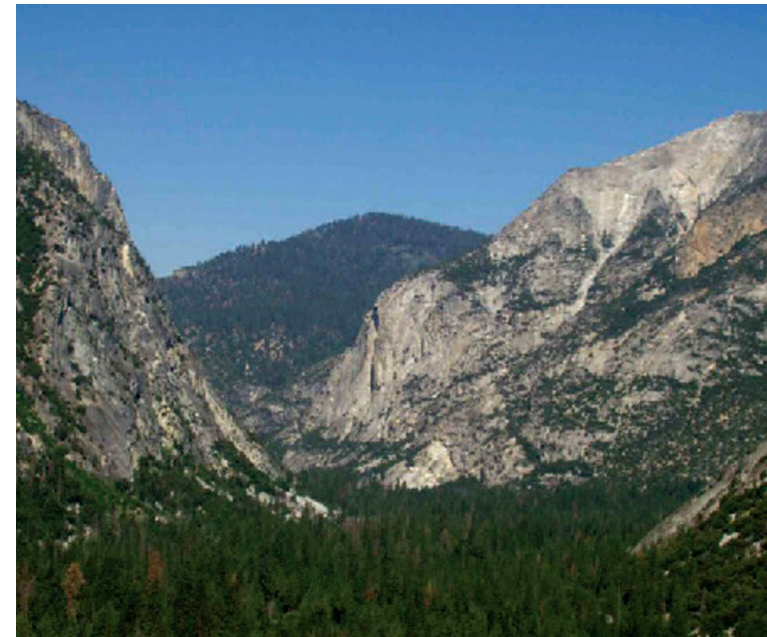
King's Canyon.

The NPS notes that information can be provided on safety, "but in the end you are responsible for your safety. Keep alert. Know about the hazards where you are going and what you are doing. Read warnings and ask a ranger for advice."