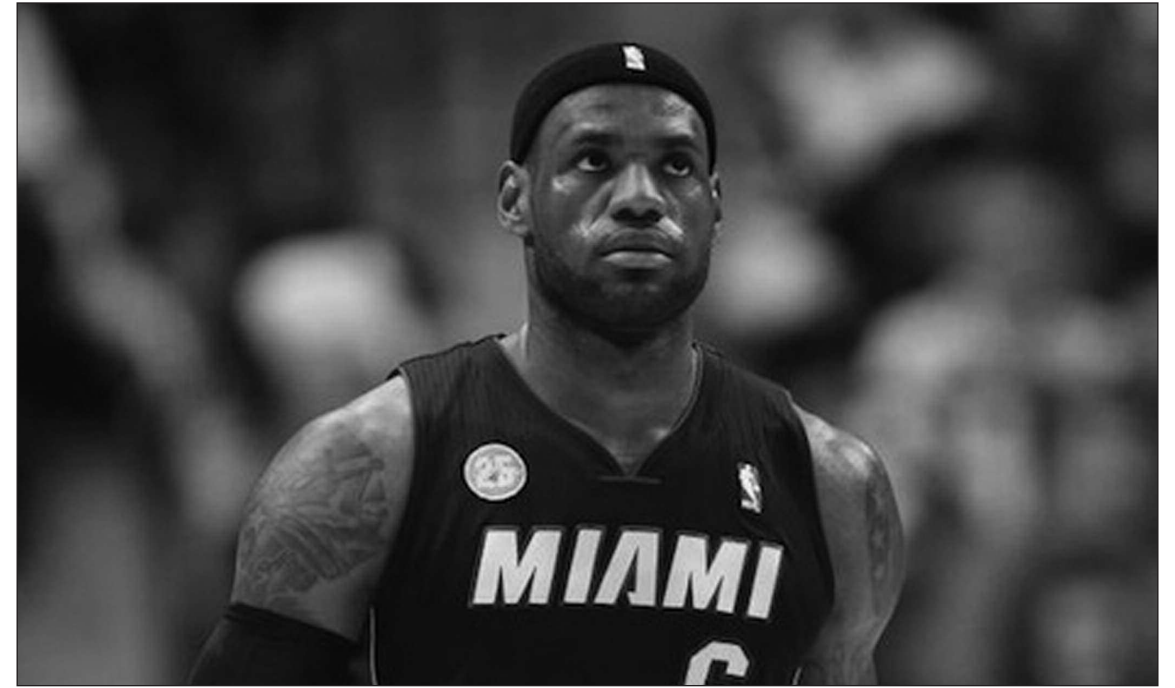
Lebron James Heat move on to the Eastern Conference Finals. The Heat awaits the winner of the Indiana Pacers and the New York Knicks series.

Now that the series between the Miami Heat and the Chicago Bulls is over, the