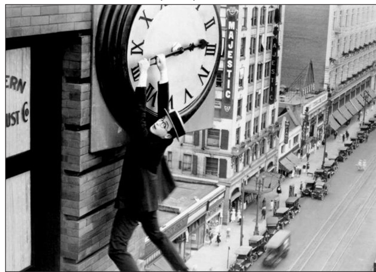
"Between a clock and a hard place."

trovertible fact that he is late, he will assume a repertoire of tense, nervous motions, all aimed at telegraphing, "I'm busy. Don't even think about detaining me. I'm going places." This translates directly to the gymnastic language of those daredevil cars that dart madly in and out of morning traffic and honk when another motorist, waiting for a light to turn, zones out for a nanosecond when their gaze has strayed to a dashboard clock and the light suddenly turns green.