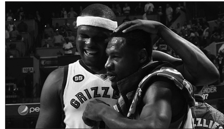
Zach Randolph & Tony Allen

Zach Randolph led the Grizzlies with 28 points, 14 rebounds, two assists and two steals. Mike Conley had a near triple double with 13 points, 11 assists and seven rebounds. Marc Gasol came away with 10 points, seven rebounds, three steals and three blocks on the night. The