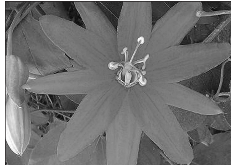
Red passion flower seems quite exotic.

Most vines are aggressive in nature. They exploit trees for support, and then compete with them for space. Some are complaisant enough to mingle relatively peacefully with the trees that support them. Less honorable vines have no problem overwhelming the canopies of their supportive trees. Creeping fig and other related figs are known as ‘strangler figs’ because their