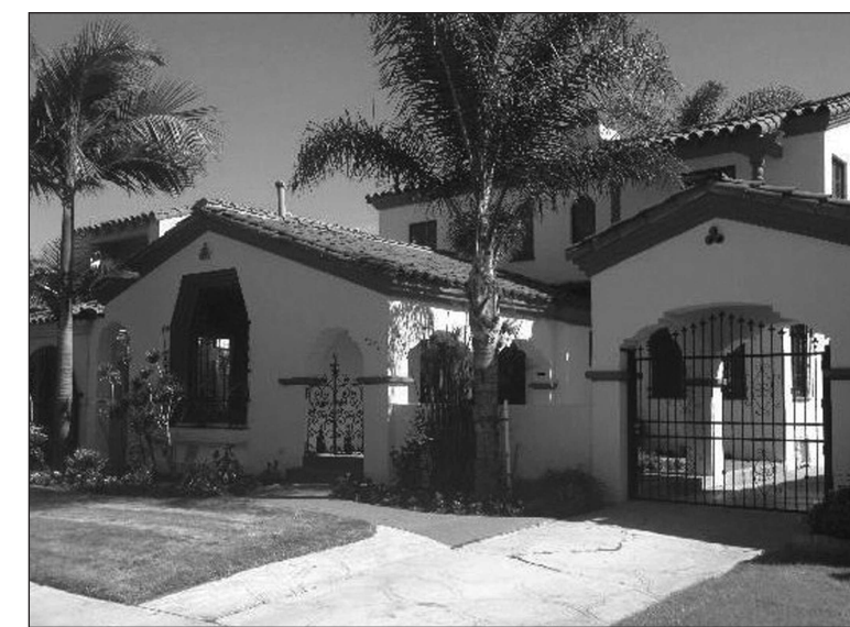
Short sales are a great way to find a home.

Be sure you have flexibility in the time needed to close the sale. This would allow for enough time to move and for you