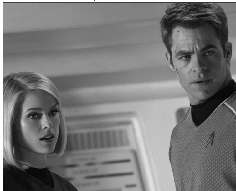
Alice Eve and Chris Pine in “Star Trek Into Darkness.”

After the secret “Section 31” installation is bombed by Starfleet agent John Harrison (Benedict Cumberbatch), a string of events are set into motion that will test the willpower of the USS En-