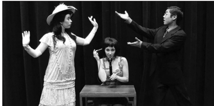
"Thoroughly Modern Millie."

In 1922, Millie moves to NYC from Kansas, and determined to be a success she enters the workforce and is devoted to the new women's movement. Her plans for independence are put aside when she falls in love with carefree Jimmy.