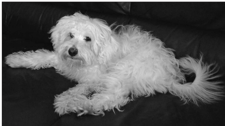
foafla.petfinder.com. We're all waiting for that special, loving home to call our very own! FRIENDS OF ANIMALS 310-479-5089

I'm smart enough to know that there are some people that don't want to have to "brush", so we have lots of "non-brushing" doggies here, too. You can see them all, plus all of the wonderful kitty cats that are here, if you check the website at: