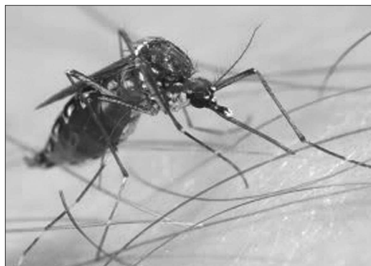
Protect yourself from West Nile virus.

It is strongly recommended that if you have been bitten by a mosquito and begin to exhibit any of these symptoms that you consult a physician as soon as possible. It has also been noted that those at the highest risk for severe cases are children, the elderly, and anyone with weakened immune systems.