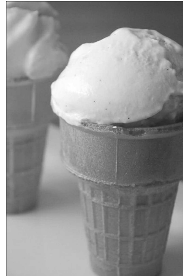
Cool off with homemade ice cream.

2. Remove the bowl from the freezer, uncover and, using an electric mixer, beat the liquid mixture for 2-3 minutes. Cover the