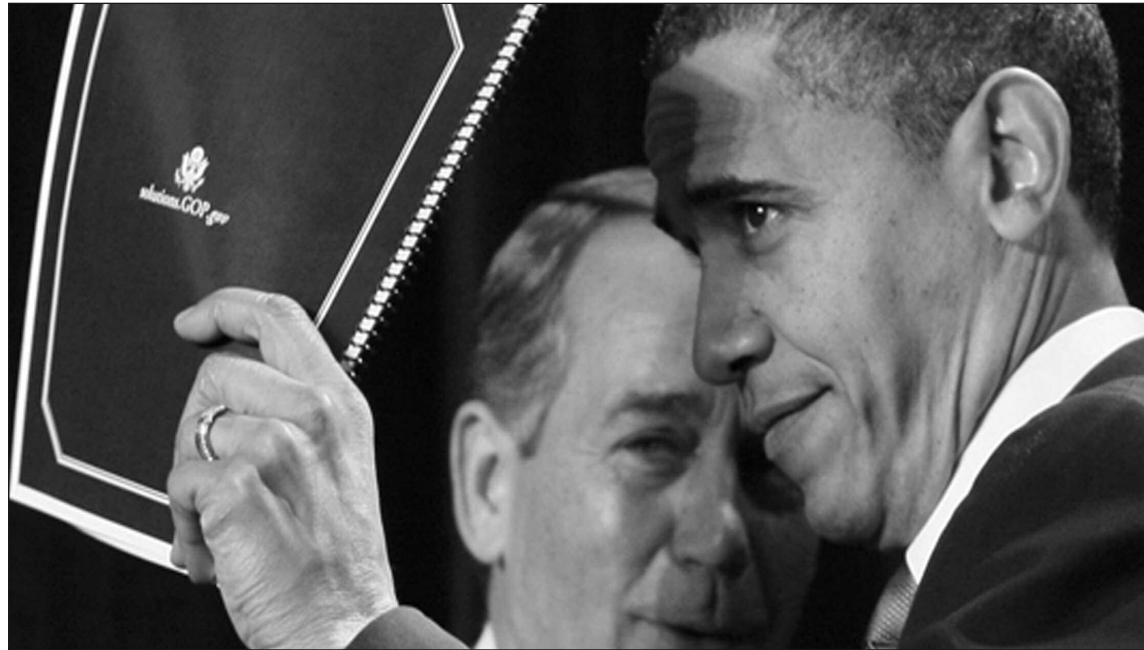
President Obama and Speaker Boehner.

Fox News. The hosts and anchors on that network refer to Republican Speaker John Boehner as "Speaker Boehner" and to Democratic President Obama as "Obama." The liberals love MSNBC. Chris Matthews and others refer to Democratic Senator Harry Reid as "Majority Leader Reid" or even as "Sir," while referring to former Republican President George Bush as "Bush" or former Vice President Dick Cheney just as "Cheney." The subliminal messages we receive from only watching what we like and agree with is the disrespect disregard and dislike we have for people we disagree with politically, that it is acceptable behavior and that the people we agree with are smarter than the other side, more professional and therefore more respectable.