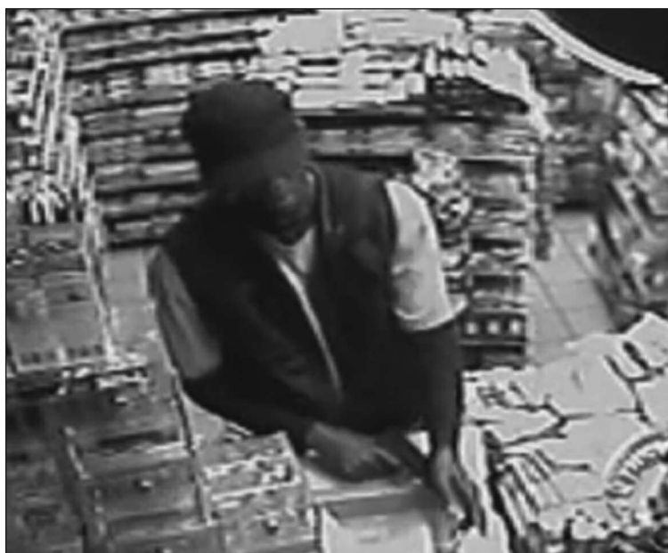
CCTV footage of a suspect robbing the service station.

Anyone with information to relate to LAPD West L.A. regarding this crime can call 310-444-1520, 877-LAPD-24-7 or remain anonymous by calling 800-222-8477.